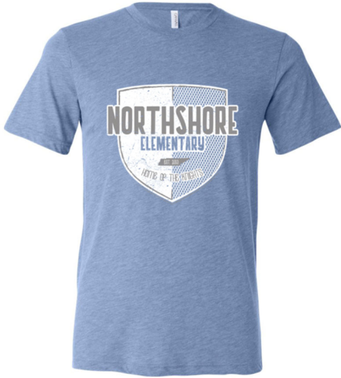
1. Shield Design Short Sleeve LIGHT HEATHER BLUE