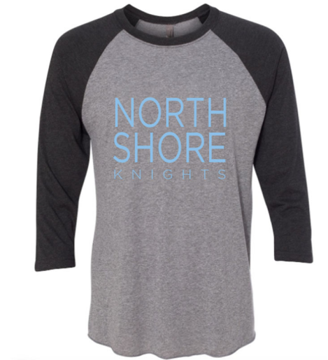
5. Baseball Tee GRAY/BLACK SLEEVES

To see actual colors visit the Northshore Elementary PTA Facebook Page