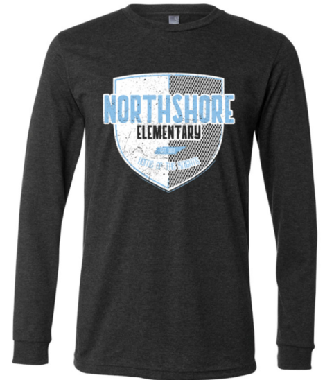
2. Shield Design Long Sleeve DARK HEATHER GRAY