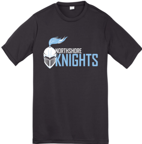
3. Knights Athletic Design DARK GRAY